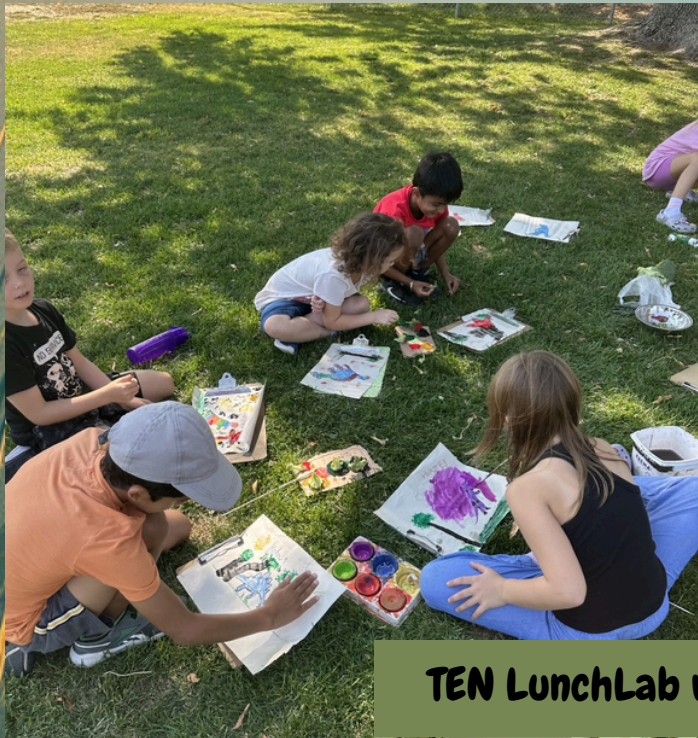
TEN LunchLab with SOSS